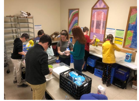
In September, the youth helped bag sugar and rice for the Chugiak/Eagle River food pantry.