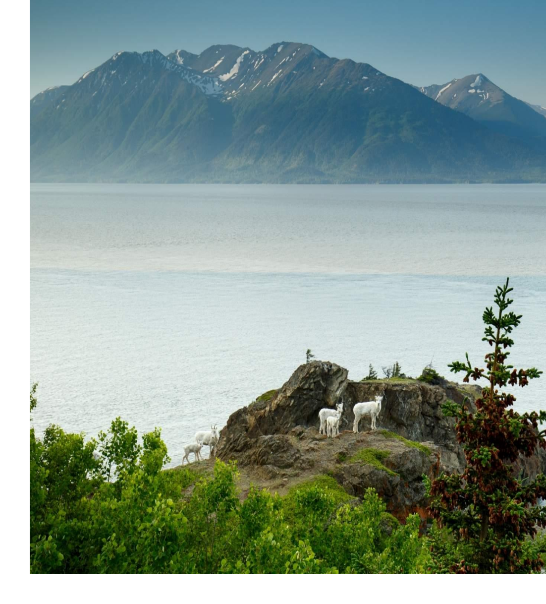
Eagle River Presbyterian Church April 21, 2024

The April communion table flowers are sponsored by Lucy Witt.